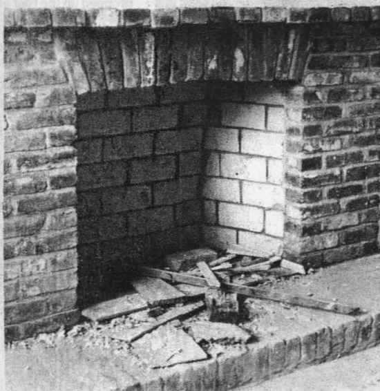
Fireplace in sitting room is of used brick